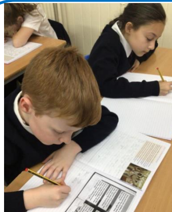
Year 4 loved writing a letter as one of Jesus' followers in RE.