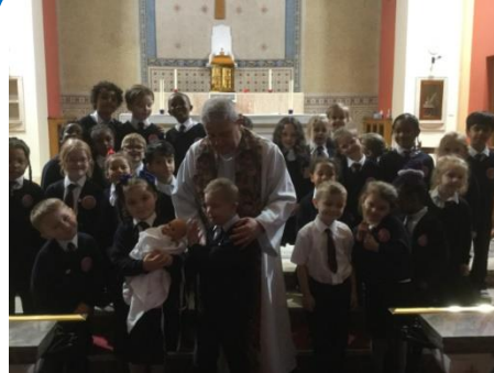
Year 1 loved learning about baptism in church.