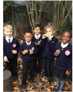
Year 2 loved their reward for having the best attendance in Autumn 1.