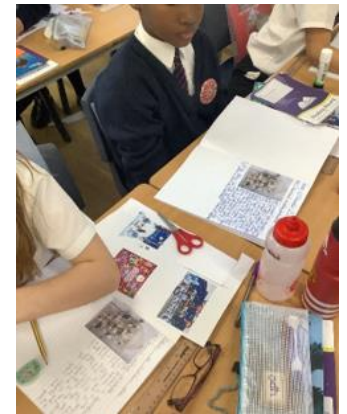
Year 5 loved investigating different calendars for their DT project.