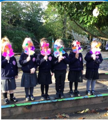
Early Years loved making masks of the 'little red hen.'

The children and teachers are very proud of the learning that has been happening within school this week. To see more pictures, visit our Facebook, Twitter and Instagram pages.