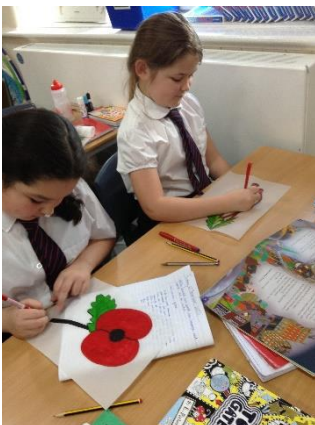
This week Year 5 have been learning about the importance of celebrating Remembrance Day and the relevance of the poppy.