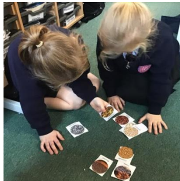
Year 3 have been learning all about seeds this week in science. They have sorted and classified the different seed types by size, colour and shape.