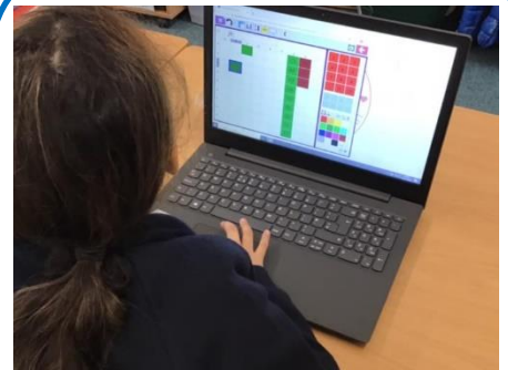
Year 4 have been learning to use coordinates to help locate cells on a spreadsheet in computing.