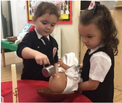
Nursery have been learning all about baptism and have enjoyed acting it out.

The children and teachers are very proud of the learning that has been happening within school this week.