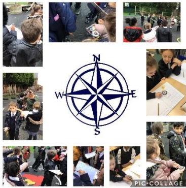
Year 2 had a very exciting time learning about compass points! We went outside to see what we could find!