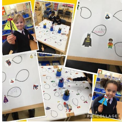
Reception have been busy learning about superheroes this week ready to read our new story 'Even Superheroes Have Bad Days'