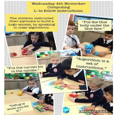
Year One have started their Coding unit by being Lego Builders. They instructed their partners to build a Lego animal by speaking.