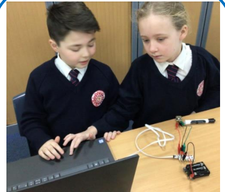
Year 5 loved programming a microcontroller to make an LED switch turn on.