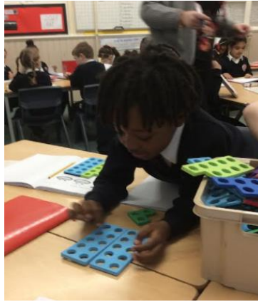
Year 1 loved doing addition and subtraction in maths.