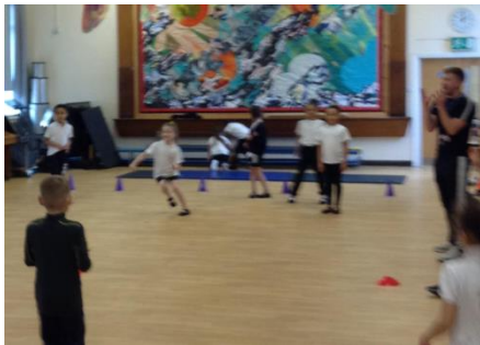
Year 3 loved being active in PE this week.