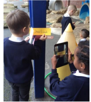
Year 2 loved exploring to find things that are alive, once lived or never lived.