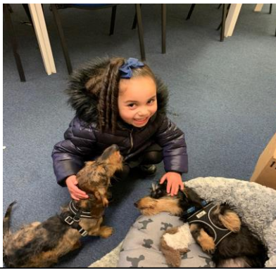
The dogs always love seeing the children in St. Ambrose.