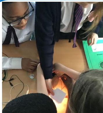
Year 6 loved investigating what affects the brightness of a lightbulb.