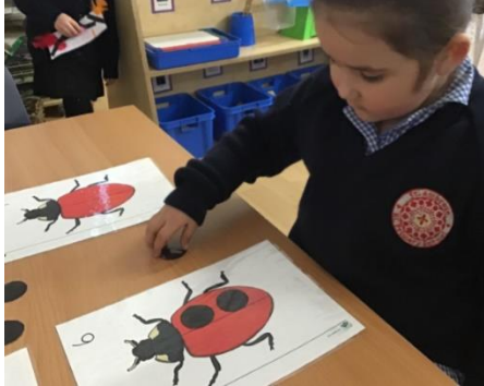
Early Years loved practicing their counting.

It has been another wonderful week at St. Ambrose and we are proud of the children and their learning. You can see more pictures of their learning on our social media pages.