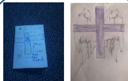
Caleb Year 1

Last week, the children were set a DT home learning challenge of creating a boat that floats. Alfie and Kyra shared pictures of their floating boats. What fantastic creations!