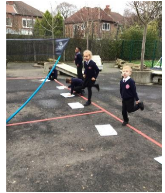
Year 2 loved testing out predictions about what would make their heart beat faster