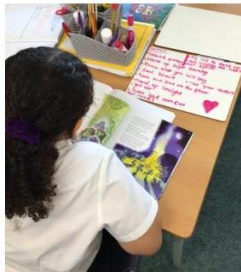
Year 4 loved reciting verses to perform for a class poem.