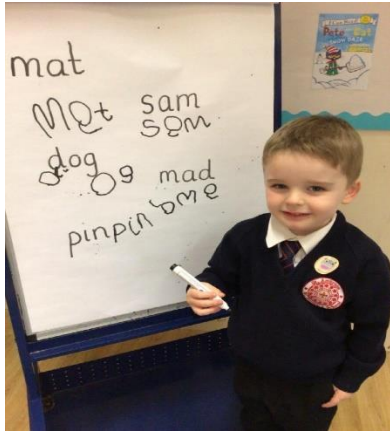
Early Years loved practicing their handwriting.

It has been another wonderful week at St. Ambrose and we are proud of the children and their learning. You can see more pictures of their learning on our social media pages.