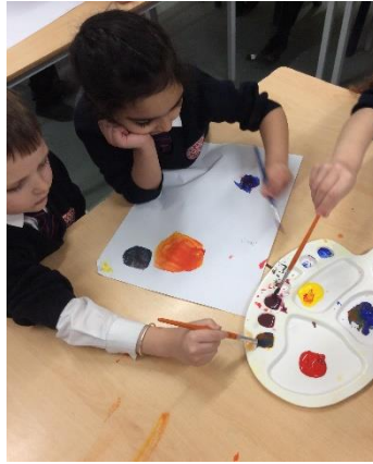
Year 1 loved mixing primary colours in art.