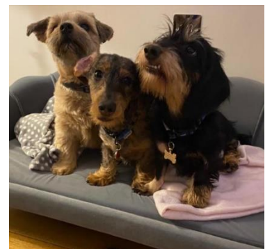
The terrific trio wish everyone a 'pawsome' weekend.