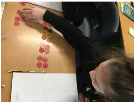
Year 3 loved using counters to practice sharing equally in maths.