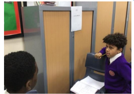
Year 5 loved doing a maths hunt whilst practicing division.