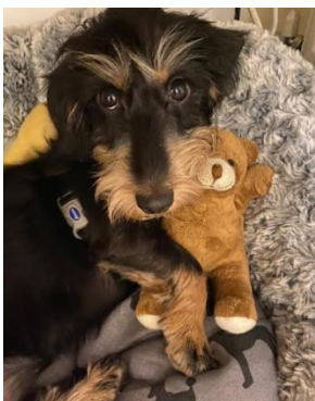
It's always lovely to cuddle something that you like that makes you feel good.