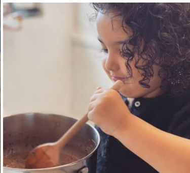
Juwayria (nursery) has been doing a lot of creative learning this week.