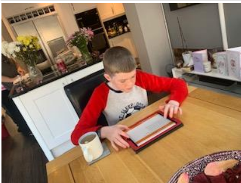
After a good breakfast, Alex was eager to complete his online learning