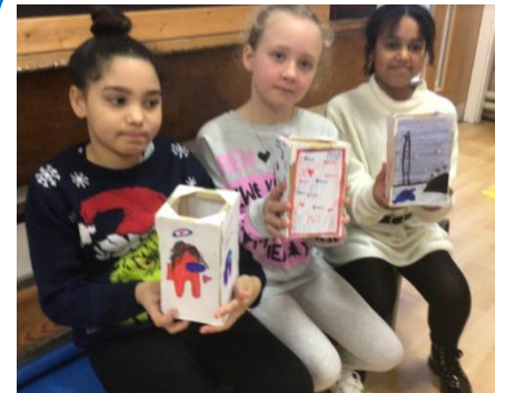
Year 5 loved making their own desk tidy in D.T.