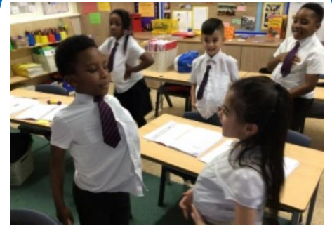
Year 2 loved role-playing the visitation between Elizabeth and Mary in RE.