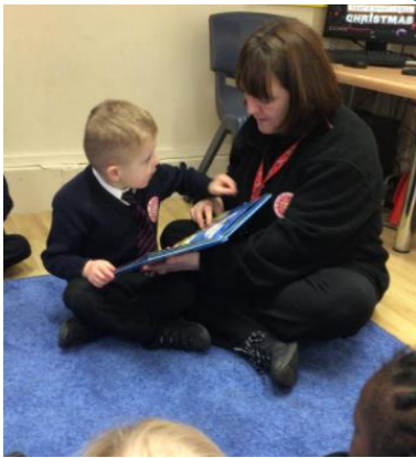
Early years loved listening to the Nativity story.

The children and teachers are very proud of the learning that has been happening within school this week. To see more pictures, visit our Facebook, Twitter and Instagram pages.