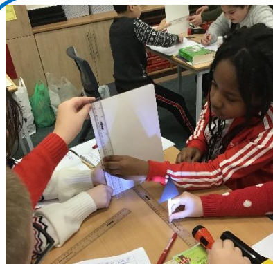
Year 6 loved investigating how the size of a shadow can change.