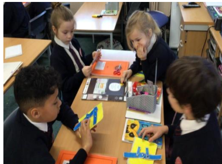
Year 4 loved making levers and linkages in D.T.