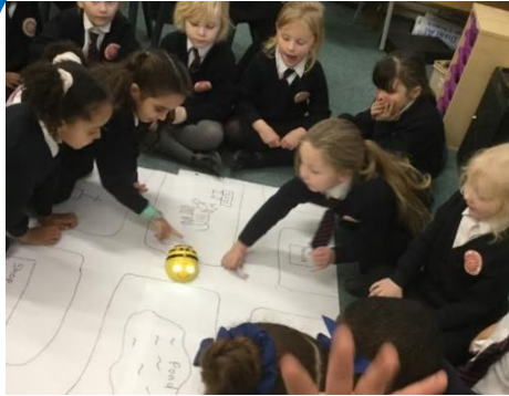
Year 1 loved learning how to use maps in geography using different routes.