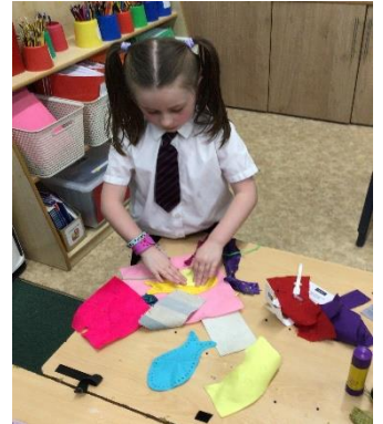
Year 2 loved exploring different joining techniques in D.T.