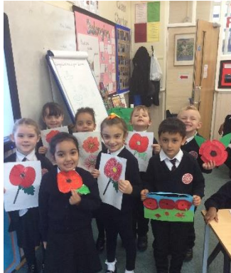
Year 1 loved doing their home learning about Remembrance Day.