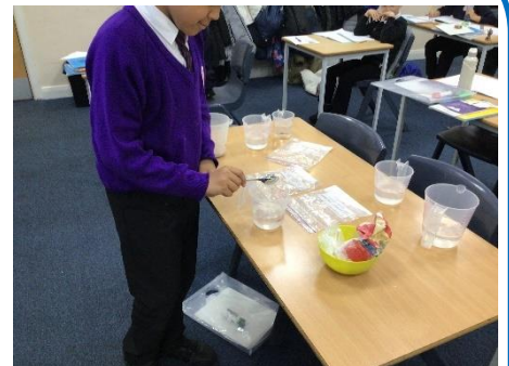
Year 5 loved investigating which solids dissolve in water.