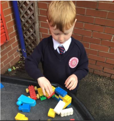
Early Years have loved building with Duplo this week.

The children and teachers are very proud of the learning that has been happening within school this week. To see more pictures, visit our Facebook, Twitter and Instagram pages.