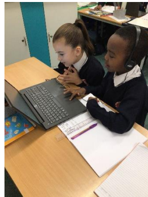
Year 4 loved practicing recording themselves in computing.