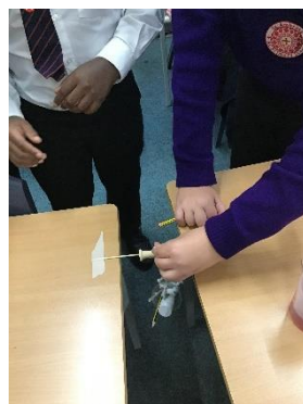
Year 6 loved learning how pulleys work.