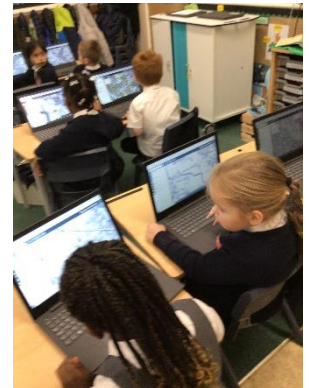
Year 2 loved exploring the local school area on digimaps in Geography.