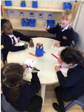
Early Years loved learning about the baptismal candle.

The children and teachers are very proud of the learning that has been happening within school this week. To see more pictures, visit our Facebook, Twitter and Instagram pages.