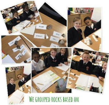
Year 3 loved comparing rocks in science.