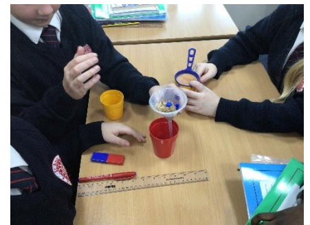
Year 5 loved investigating how to separate solids in science.