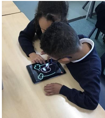
Year 1 loved exploring freehand drawing tools on the iPads.