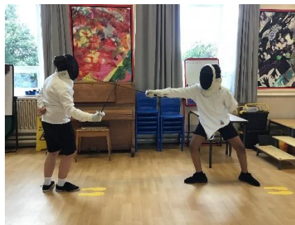
Year 6 loved learning new skills in PE this week. They love doing fencing.