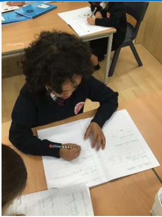
Early Years loved writing their new sounds in Read Write Inc.

The children and teachers are very proud of the learning that has been happening within school this week. To see more pictures, visit our Facebook, Twitter and Instagram pages.