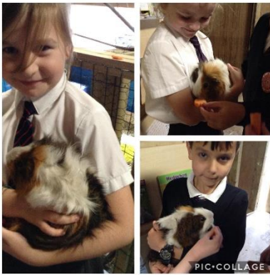
Year 3 loved looking after the guinea pigs this week and learning how to care for them.