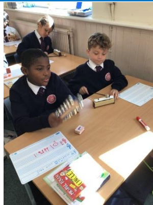
Year 4 loved using a variety of instruments to play music that they composed,