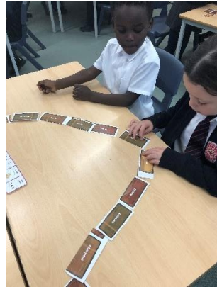
Year 1 loved learning about families and choosing words associated with our families.