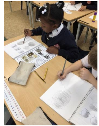
Year 2 loved exploring tone and texture using different mediums in art.