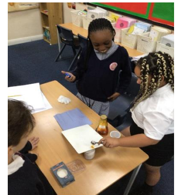
Year 5 loved investigating the viscosity of different liquids in science.