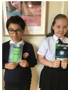
Year 6 loved creating leaflets advertising their Earth Zone in literacy this week.