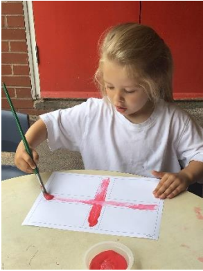
Nursery loved decorating flags, ready for the big final this weekend.

The children and teachers are very proud of the learning that has been happening within school this week. To see more pictures, visit our Facebook, Twitter and Instagram pages.