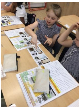
Year 2 loved exploring and examining some primary sources from John Alcock and Arthur Browns historic transatlantic flight!