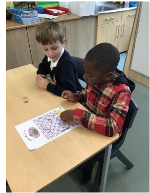
Year 1 counting forwards and backwards within 100, when playing snakes and ladders.,