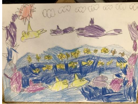
Reception loved learning about the creation story's and how to look after our world. They have drawn pictures of their favourite part.