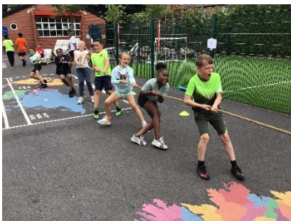
Year 5 loved participating in all the events in Sports' Day. They especially loved the Tug-of-War