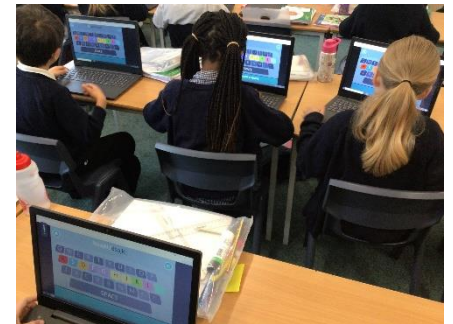
Year 4 loved practicing their typing skills and using this to help them use search engines to answer questions in computing.