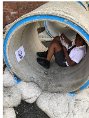
Year 3 loved their treasure hunt to find out the names of the bones in their body!