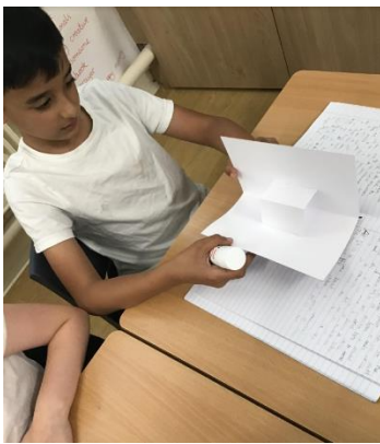
Year 3 loved creating pop up features in DT this week.