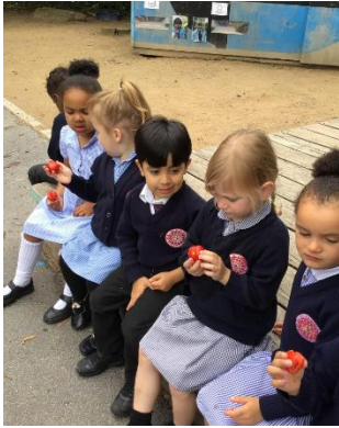
EYFS loved tasting tomatoes.

This week has been another wonderful week of learning at St. Ambrose and we are very proud of the children.