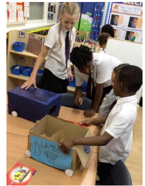
Year 5 loved visiting Early Years to explain their learning about vehicles in D.T.