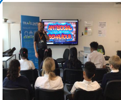
Year 6 loved learning about different life skills at Crucial Crew.

It starts at 9am and parents are welcome to join the children in celebration.