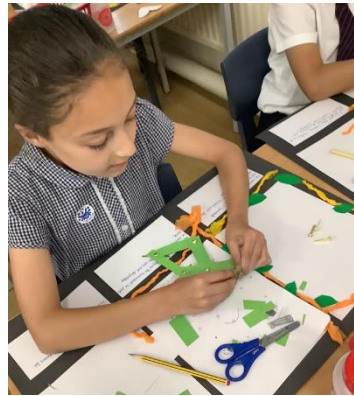
Year 4 loved creating hinges in DT.