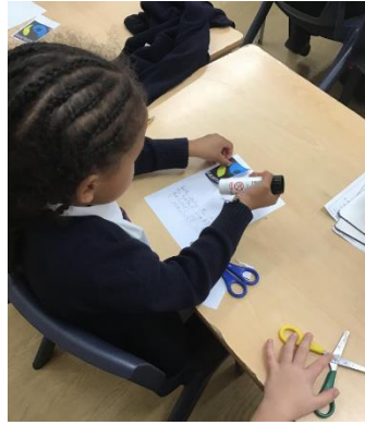
Year 1 loved learning about fair trade in RE.