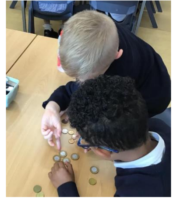
Year 2 loved solving two step problems with money in maths.