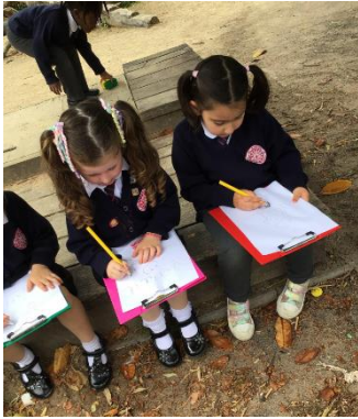
EYFS loved writing outdoors this week.

This week has been another wonderful week of learning at St. Ambrose and we are very proud of the children.