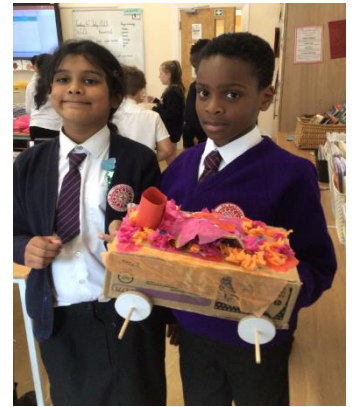
Year 5 loved creating their toy cars in DT.