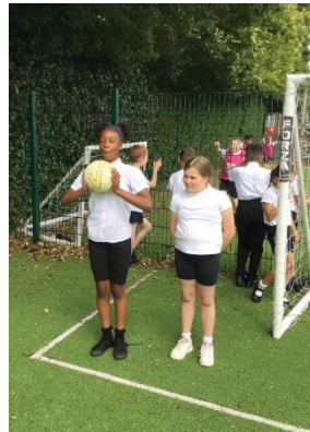
Year 4 practising skills for the pentathlon in PE.