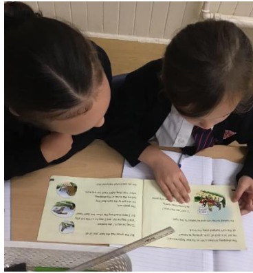
Year 1 have loved reading longer stories in RWI.