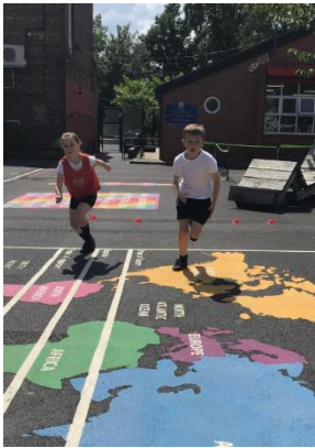
Year 3 loved completing their pentathlon events in P.E. this week!