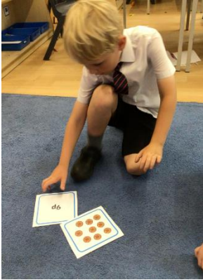
EYFS loved learning about money this week.

This week has been another wonderful week of learning at St. Ambrose and we are very proud of the children.