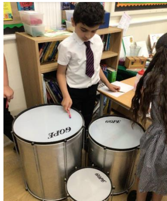
Year 4 have been investigating pitch in their science topic 'sound'.