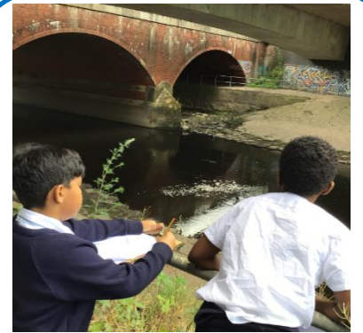
Year 5 loved carrying out fieldwork at the river Mersey and identifying features of the river