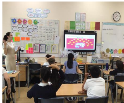
Year 6 loved their session from Kooth, helping them prepare for high school and develop their mental health.