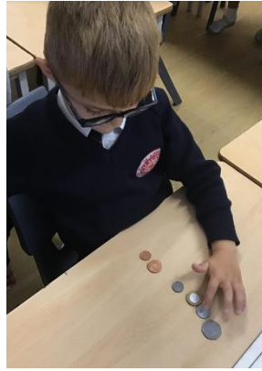
Year 1 also loved learning about money this week in Maths.