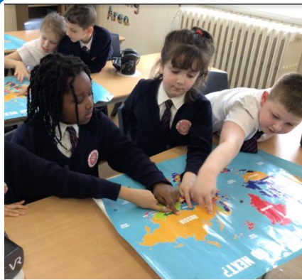
Year 4 loved learning about volcanoes.