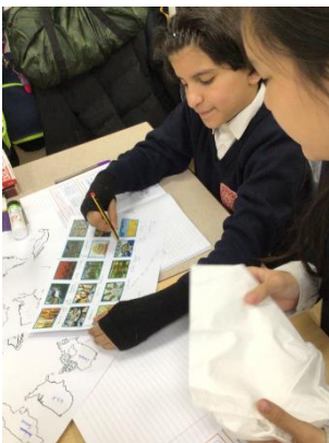
Year 6 loved learning about different types of trade in geography.