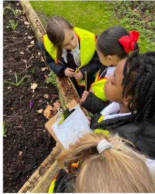
Year 1 loved identifying different plants in Chorlton Water Park.