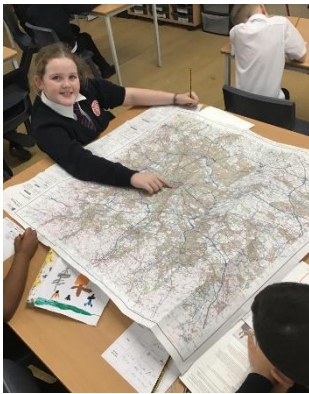
Year 3 loved using OS Maps to compare different areas of land use in Greater Manchester!