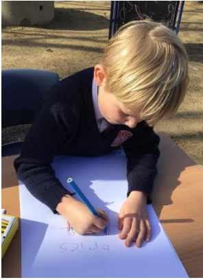
Early Years loved drawing outside this week.

It has been another wonderful week at St. Ambrose and we are proud of the children and their learning. You can see more pictures of their learning on our social media pages