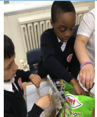
Year 2 loved planting seeds in science.