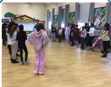
Turn a Page Workshop