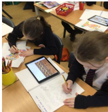
Year 4 loved designing their own Roman mosaics in art.