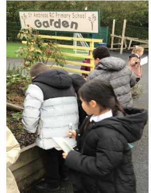
Year 2 loved exploring our school grounds for mini-beasts in science.