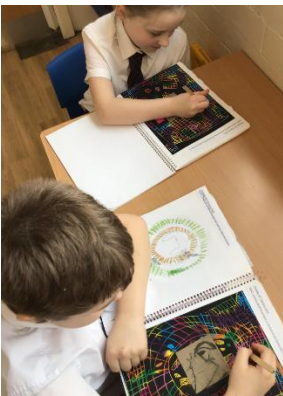
Year 3 loved creating piece of sgraffito art this week!