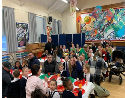
Year 1 loved having a special meal with their families.