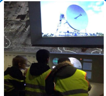
Year 5 loved their visit to Jodrell bank this week.