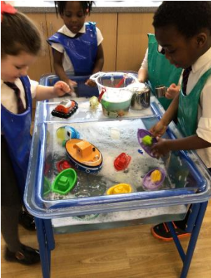
Early Years loved learning sinking and floating.

It has been another wonderful week at St. Ambrose and we are proud of the children and their learning. You can see more pictures of their learning on our social media pages.