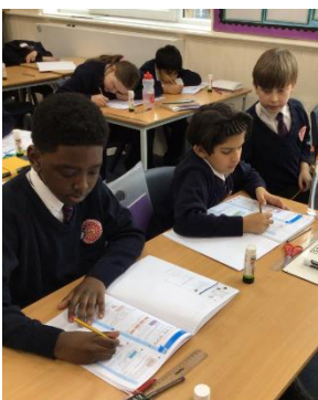
Year 6 loved cracking algebra in maths.