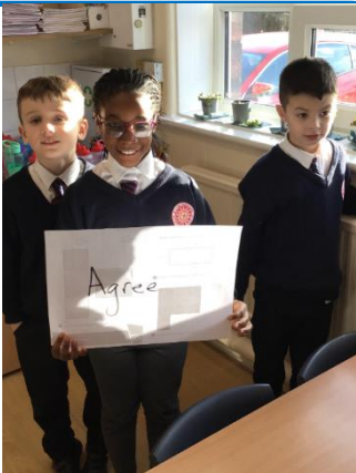
Year 3 loved hearing balanced arguments in English this week.