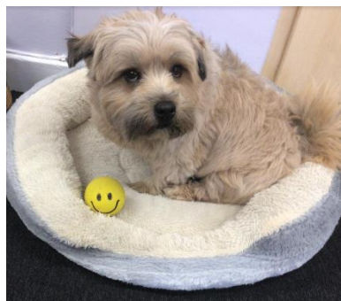
Bernard had an extra smile for everyone during Children's Mental Health Week.