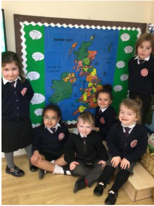
Early Years loved learning about the British Isles

It has been another wonderful week at St. Ambrose and we are proud of the children and their learning. You can see more pictures of their learning on our social media pages.