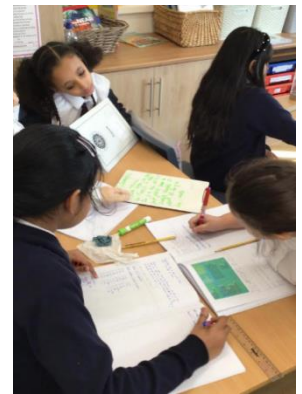
Year 5 loved creating a script for a French weather forecast.