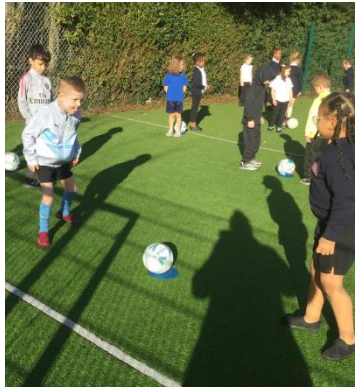
Year 1 loved practicing their football skills in P.E.