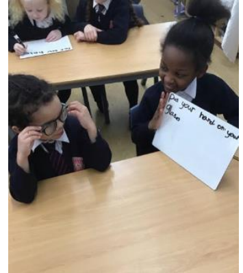
Year 2 loved learning about giving instructions in computing.