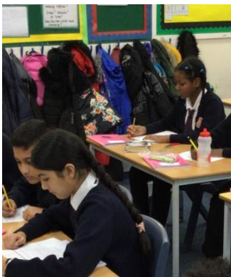
Year 6 loved writing about inspirational women on their journey in RE.