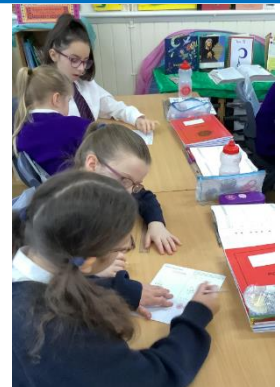
Year 5 loved coaching each other on how to convert a mixed number into a fraction.