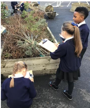
Year 3 loved exploring the flower garden in science to observe plants in the winter.