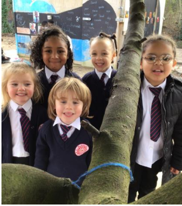
Early Years loved being back in school.

It has been another wonderful first week back at St. Ambrose and we are proud of the children and their learning. You can see more pictures of their learning on our social media pages.