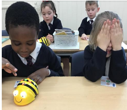
Year 1 have loved working in pairs to guess the