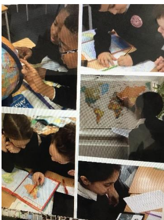
Year 5 comparing the time of the day at different places on the Earth