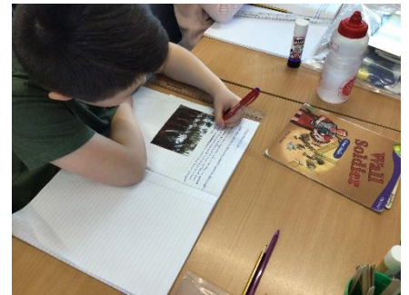
Year 4 have enjoyed learning about the Romans and their army.