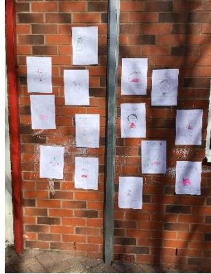
Reception have been writing posters for their class puppet 'Jim' who has gone missing. They posted them around the school to help find him.