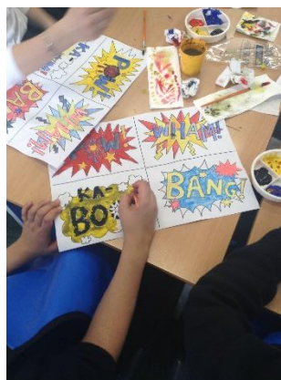
Year 6 have been practicing their skills using a variety of paints.