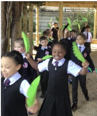
Year 2 loved reenacting Jesus' joyful entry into Jerusalem when learning about Palm Sunday.