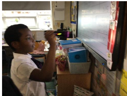
Year 3 loved learning about light and different material types in science this week.