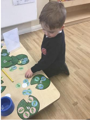
Nursery have been practising their counting skills and have started to recognise some numbers!

The children and teachers are very proud of the learning that has been happening within school this week. To see more pictures, visit our Facebook, Twitter and Instagram pages.