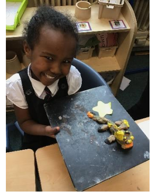
Year 1 have been creating different animals bodies using plasticine