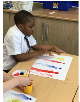
Year 1 have loved art this week. They have been exploring the use of different sized brushes and tones.