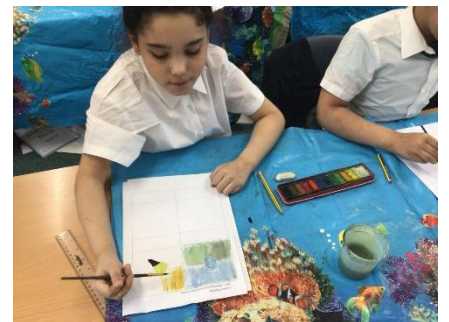
Year 4 enjoyed investigating with water colours how to create light and dark through different tones.