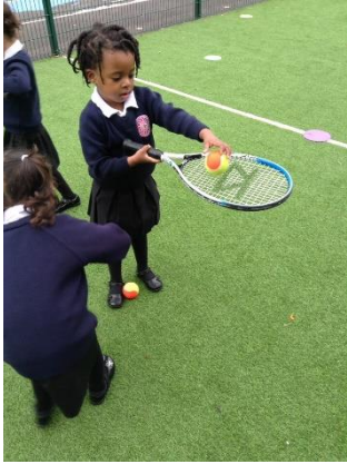
Nursery had great fun in their PE lesson this week, trying to balance a tennis ball on their bat

The children and teachers are very proud of the learning that has been happening within school this week. To see more pictures, visit our Facebook, Twitter and Instagram pages.