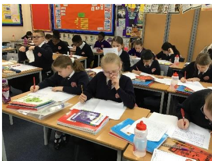
Year 5 enjoyed learning and writing about the Viking raids on Lindisfarne.