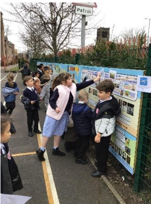
Year 2 loved exploring the outdoor timeline and placing their significant events in the history of flight on it.