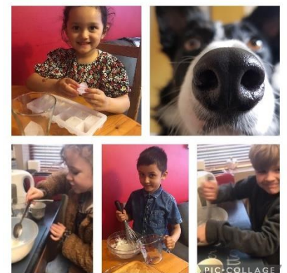
Well done to all those who took 'Science Selfies' at home to show science around them.