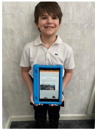
Year 3 children have been researching about fashion and making their own presentation.