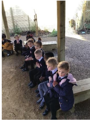
Reception went to the prayer garden for collective worship and focused on how we grow during Lent.